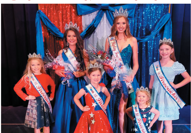
Monday, June 30 - Tuesday, July 1