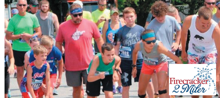
12:00 p.m. Sheetz Grand Parade

Parade will begin at Ripley High School. The route follows South Church Street to Main Street and concludes at the intersection of West Main Street and Academy Drive. This year's parade will be televised by WOWK-TV 13.